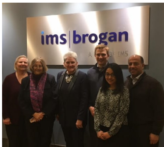
CCSN meets with IMS Brogan - March 2016