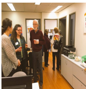
Guests & CCSN Staff chat while enjoying drinks and snacks during CCSN's World Cancer Day Open House - February 2016