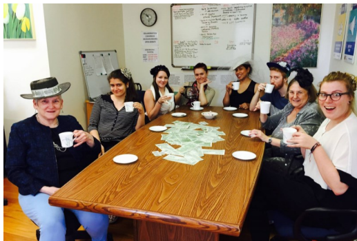
CCSN supports National Cancer Survivors Day by hosting an office coffee party to make a positive impact on the lives of people in need. - June 2016